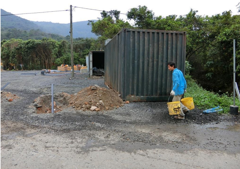
Photo 4 showing the pipe and electric pump for extraction of water from Tung Chung River