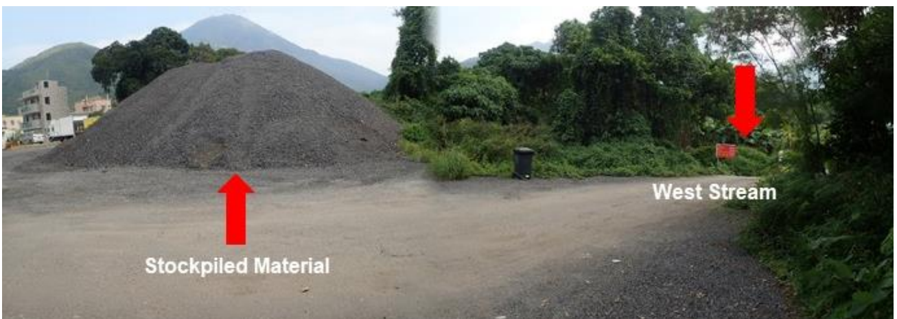
Figure 4. Stockpiled materials near the edge of West Stream of Tung Chung River (viewed in upstream direction).