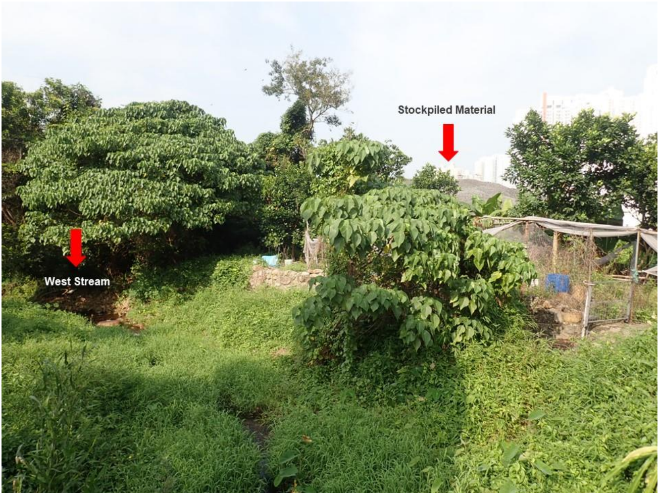
Figure 3. Stockpiled materials near the edge of West Stream of Tung Chung River (viewed in downstream direction).