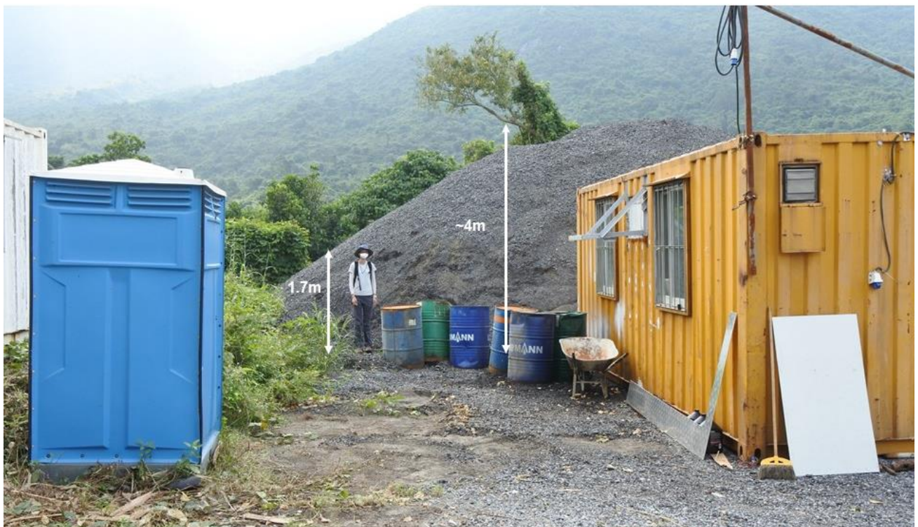
Figure 2. Stockpiled materials near the edge of West Stream of Tung Chung River (close up).